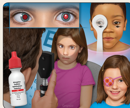
Illustration by John Karapelou

Amblyopia is the leading cause of monocular vision loss in children. Early recognition and treatment are important to prevent vision loss. The U.S. Preventive Services Task Force recommends vision screening for all children at least once between three and five years of age to detect the presence of amblyopia or its risk factors. The American Association for Pediatric Ophthalmology and Strabismus and the American Academy of Pediatrics recommend routine, age-appropriate red reflex testing, examination for signs of strabismus, and vision chart testing. Photoscreening may be a useful adjunct to traditional vision screening, but there is limited evidence that it improves visual outcomes. Treatments for amblyopia include patching, atropine eye drops, and optical penalization of the nonamblyopic eye. In children with moderate amblyopia, patching for two hours per day is as effective as six hours, and daily atropine is as effective as daily patching. Children younger than seven years receive the most benefit from treatment, but older children may still benefit. Amblyopia recurs in 25% of children, so continued surveillance is important. ( Am Fam Physician . 2019;100(12):745-750. Copyright © 2019 American Academy of Family Physicians.)