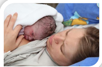
Skin-to-skin contact right after birth